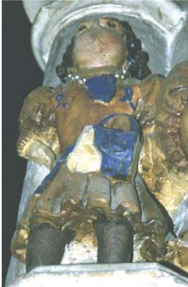
One of the Beverley minstrels wearing a cognizance with York shaped scutcheon.