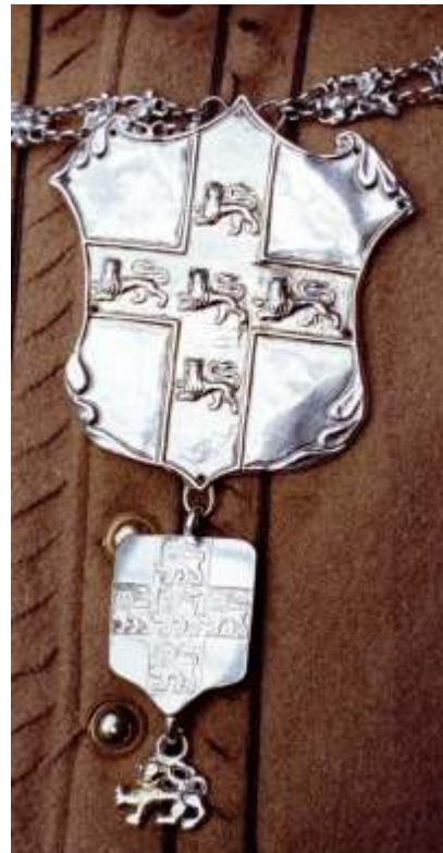
York waits' cognizance MHR13.