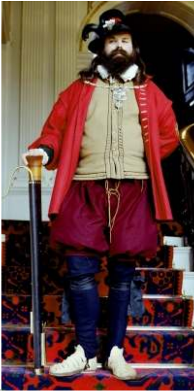
The author as John Watson with curtal, silver cognizance (real) and sleeve badge.