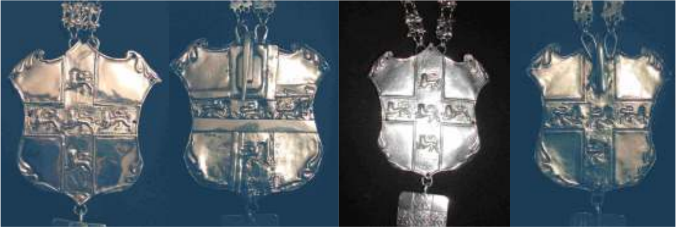
MHR12 obverse & reverse MHR13 obverse & reverse.