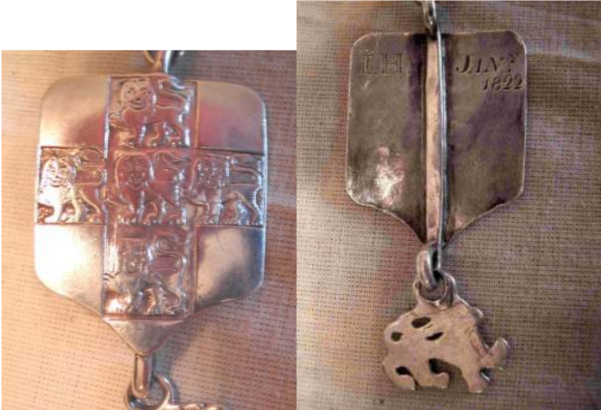
Small shield on MHR13, obverse and reverse.