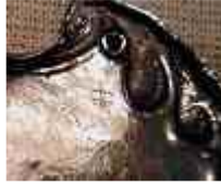
Initials engraved on the reverse of MHR 12.