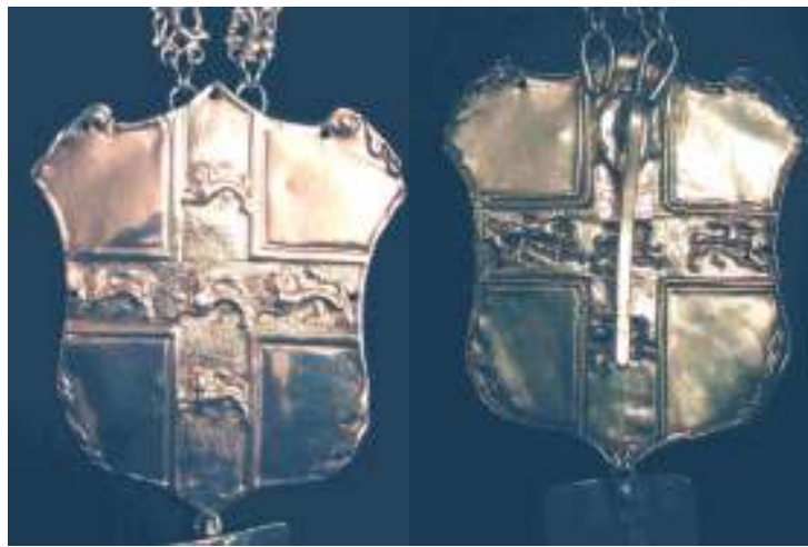
MHR14 obverse & reverse