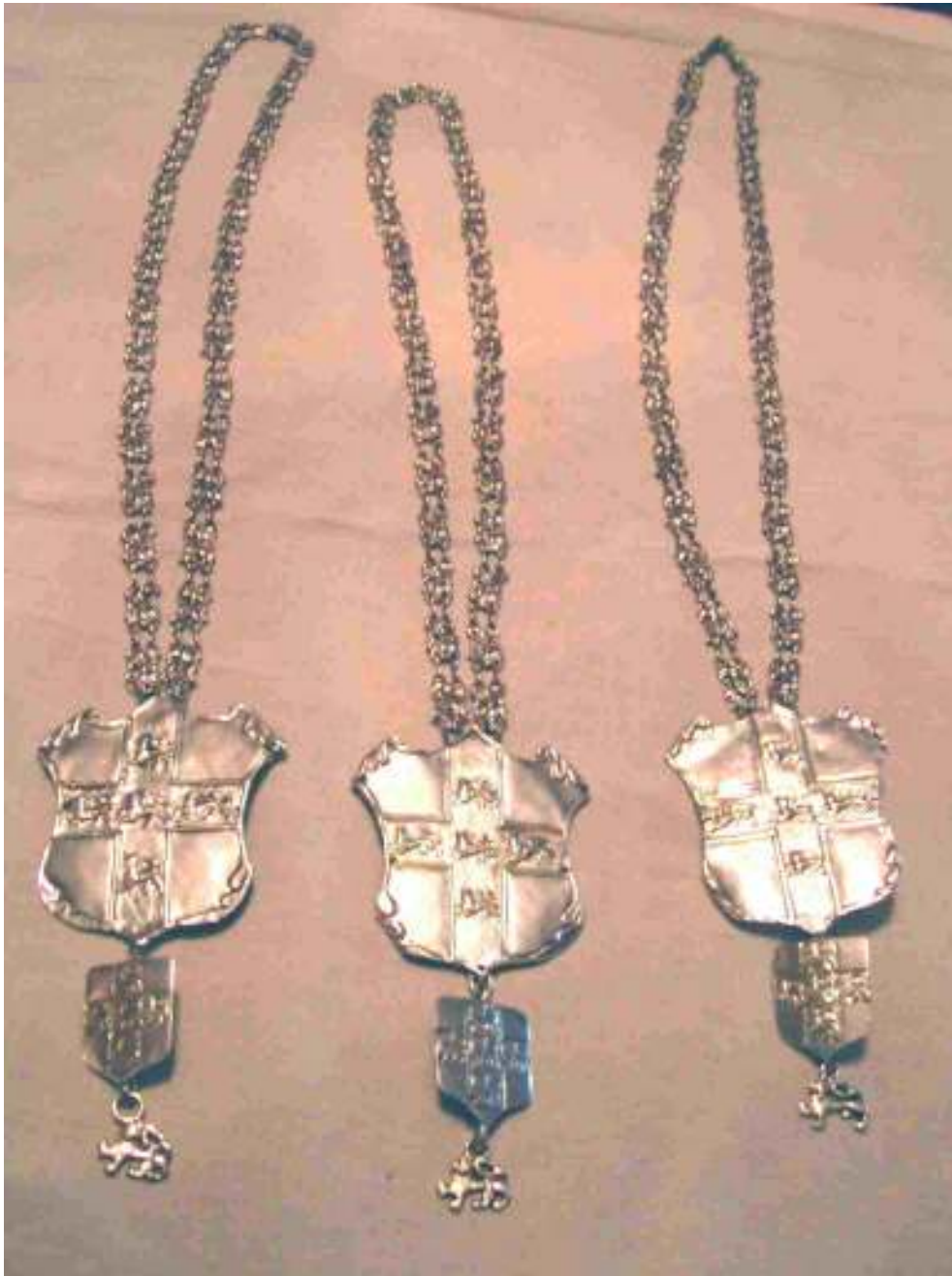
The extant York waits' cognizances.