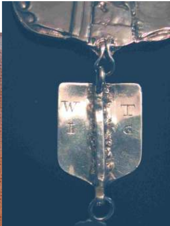
Small shield on MHR12, obverse and reverse.