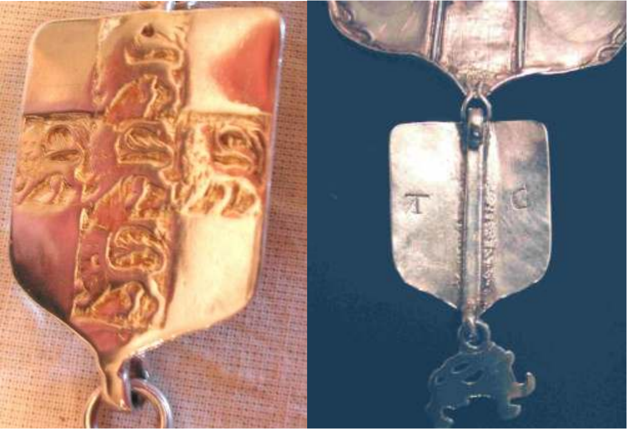
Small shield on MHR14, obverse and reverse.