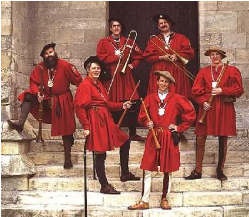
The York Waits wearing scarlet livery and replicas of the York cognizances.